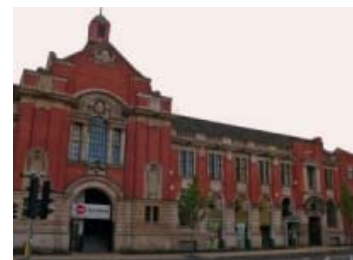
The arts centre we used for our exhibition

We chose a community arts centre for our exhibition. It was a nice place to visit and it had a lively atmosphere. It was in a good location and was within budget. Staff at the gallery were friendly and helpful, too.