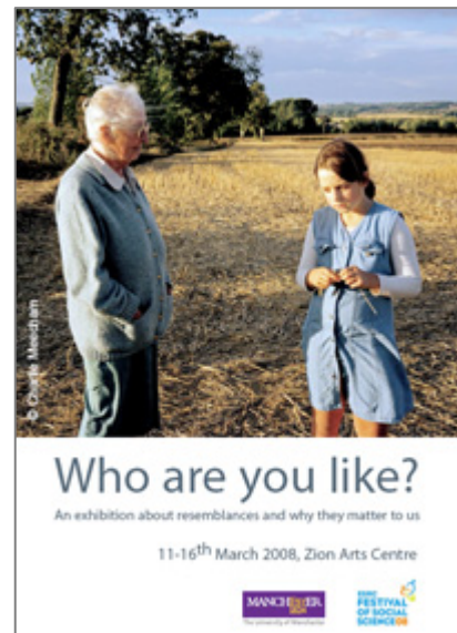
Postcard advertising our exhibition

When you are designing your leaflets, pick up a few examples from other exhibitions and see what information they have on them. This should make sure you have all the basics (title, venue, opening times, details of a launch event if there is one, brief summary, logos) and it might give you other ideas too. Include a small map if you can.