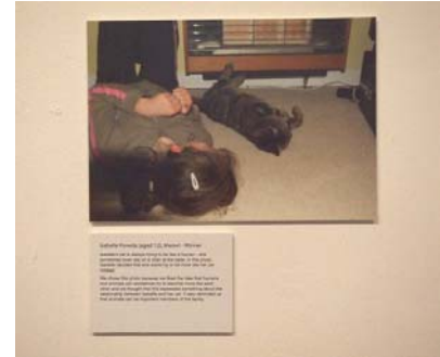
One of our display boards and its caption

If you are showing photographs or other artwork you can get captions printed and mounted on smaller pieces of foamboard which is cut to size. Ask the printer to do this – it's impossible to cut neatly at home!