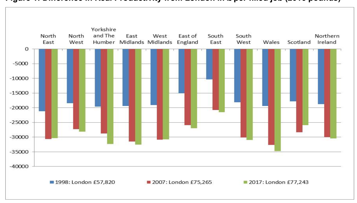
Figure 1: Difference in Real Productivity from London in £ per filled job (2016 pounds)

institutional quality is high, (Bartolini et al, 2016). Arbabi et al (2018) present empirical evidence for a link between economic underperformance and inadequate mobility for England and Wales at the intra- and inter-city scale. Their study suggests that improvements in mobility at the smaller scale within cities initially would help to facilitate much greater improvements at the inter-city scale. So, for example, improving the rolling stock and timetable reliability associated with Northern service throughout Greater Manchester should be the first step before building a high speed line connecting Liverpool, Manchester, Sheffield and Leeds, as the within city networks need to be able to cope with large amounts of commuters travelling between and within cities.