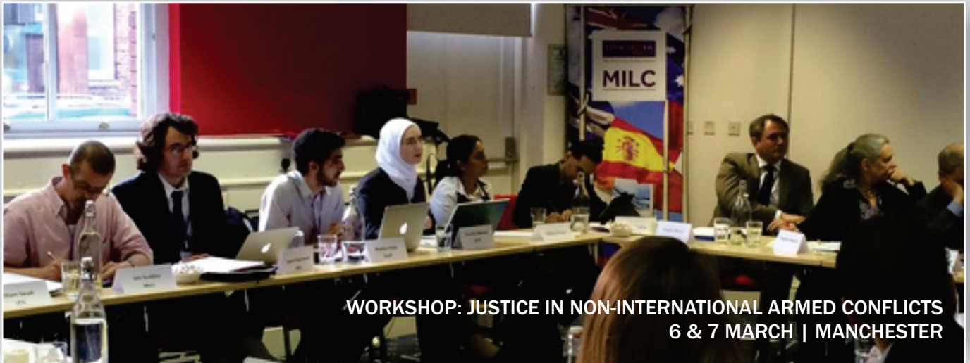
WORKSHOP: JUSTICE IN NON-INTERNATIONAL ARMED CONFLICTS 6 & 7 MARCH | MANCHESTER