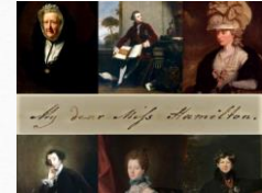
Image to Text (2011-2019) ⇒ Unlocking the Mary Hamilton Papers (2019-2022) 'a window onto eighteenth-century life, literature and language'