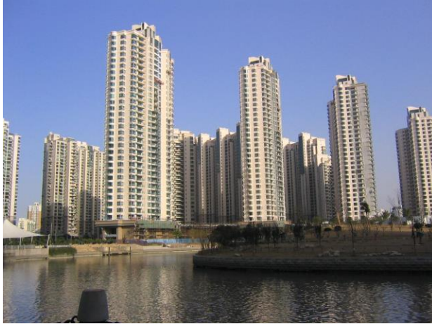
Figure 15.1 Gentrification as modernization in the form of new-build high rise developments in Liangwancheng, Shanghai