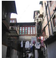
Figure 15.2a and 15.2b Shikumen lilong, Shanghai: pre-gentrification in Jing'anli and post-gentrification in the neighbouring Xintiandi

gentrification are all happening at once in China, and in a back to front way, underlain by the growth of a new middle class and a new consumerism.