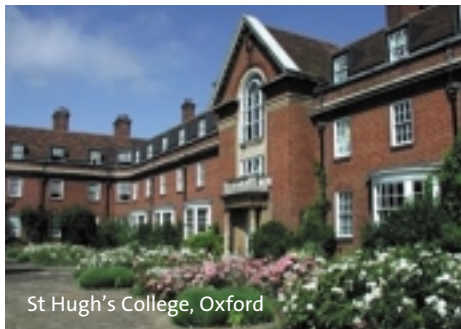
St Hugh's College, Oxford