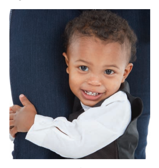
I had this image of this child asking me, "Who is my dad?" and me saying, "We don't know and you will never know" and I really didn't want to do that.

wanted a donor who played some role in the child's life. (We didn't speak to any couples who had a co-parenting relationship or who shared parenting with a donor.) Couples who chose a known donor usually told us it was a way of allowing the child to know their origins.