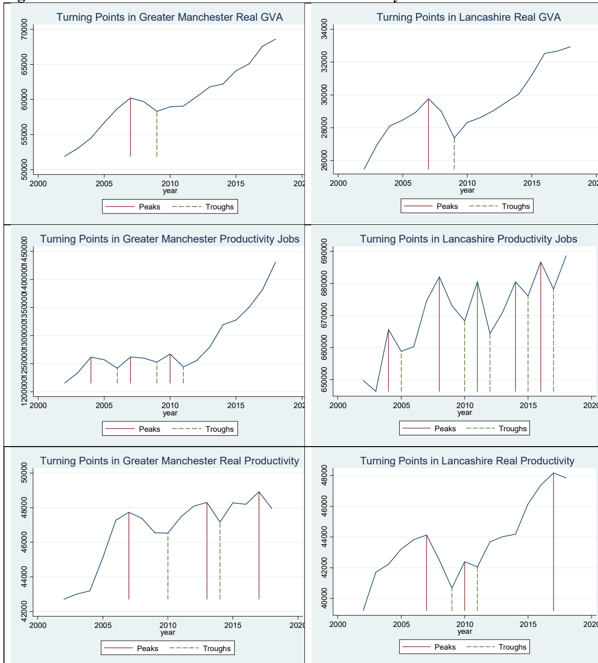
Figure 1: Greater Manchester and Lancashire Business Cycles

Table 5 presents the results for real productivity and from here we can see that the loss within the North West, GM and Manchester was lower than the national and the post-recession growth rate is much lower than before, apart from the sub-region of Stockport and Tameside (UKD35) which has a slightly higher growth rate than before. The productivity loss for Lancashire is deeper than the national and most sub-regions take longer to recover with Lancaster (UKD44) not recovering its pre-recession level. The Preston sub-region (UKD45) does recover by 2014 and has a 1.5% growth rate after recession and in Figure 2 we can see the productivity level continues to grow after recession, but mainly due to anaemic job growth. The sub-region of Chorley and West Lancashire (UKD47) has a three year recession but the loss of productivity is more resistant than the national, it has a negative rate of productivity growth before the recession but a greater rate of 2% after the recession.