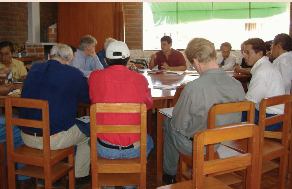
FIGURE 3 Consulting with stakeholders.

A well-designed and executed monitoring plan for water quantity and quality is critical to foster dialogue, consensus, and trust between the mine and the community. Any monitoring conducted must be conducted in a transparent, publicly available, and inclusive manner. The monitoring plan should have the capacity to adapt to changes in mine operations as the mine grows, closes old operations, and explores new areas. Any monitoring plan must have a formal, independent, external verification program. We cannot emphasize this point enough.