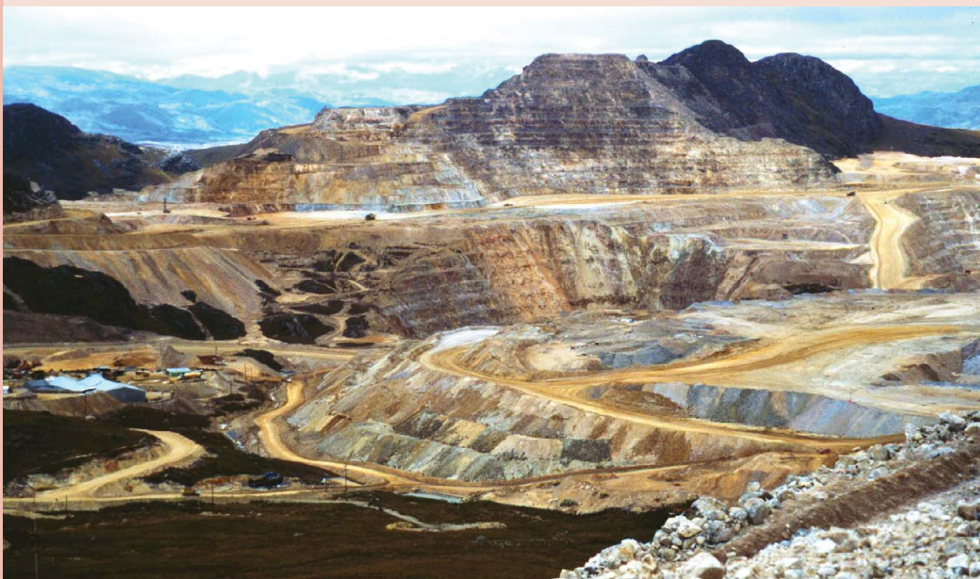
FIGURE 1 View of the Yanacocha open pit gold mine in northern Peru—the largest and probably most profitable in the world.

The delegation engaged with the mining company, national government, and a range of national, regional, and communi-