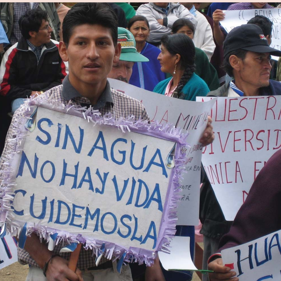
FIGURE 5 “Without water there is no life. Let’s take care of it.” Placard in Rio Blanco.

The primary objective of a water quantity study is to quantify potential effects of mine operations and facilities on surface water flow and flow from springs. Discharge should be measured continuously at the most important sites. A less expensive method for continuous measurements of discharge uses pressure transducers that are placed on the stream bottom. In both methods, a stage–discharge relationship needs to be developed for the specific locations using manual measurements of flow. Infiltration rates to the subsurface are estimated by collecting soil cores and testing them to learn how the soils in the study area store water and how water moves through them. Soil cores should be collected periodically from the tailings pile and the same measurements conducted to understand how much water may be infiltrating the tailings pile and flowing over the surface of the tailings pile.