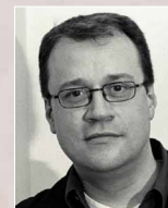
Russell T. Davies

TV screenwriter, producer and director Russell T. Davies started out in the BBC children's department, before moving to Granada Television (where he wrote for and produced the award-winning Children's Ward ) and working as a freelance writer. He was catapulted into the public eye by the ground-breaking series Queer as Folk , which presented the lives of a group of gay men in urban Manchester with explicit honesty, which was followed by prime time hits Bob & Rose and The Second Coming . His most notable achievement is the revival of science fiction series Doctor Who after a 16-year hiatus, which also led to the commission of the spin-off series Torchwood and The Sarah Jane Adventures . Davies was awarded an OBE for services to drama in 2008.