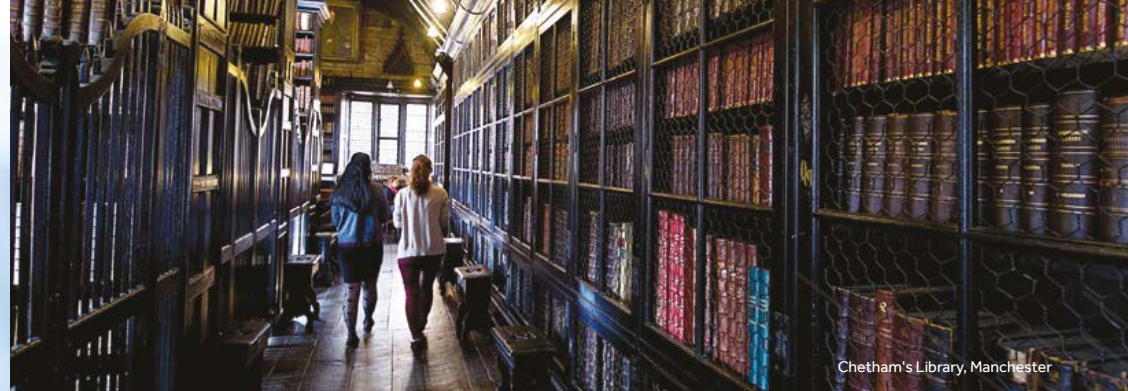
Chetham's Library, Manchester