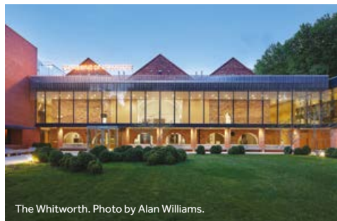
The Whitworth.

Find out more about the arts in Manchester: www.creativetourist.com