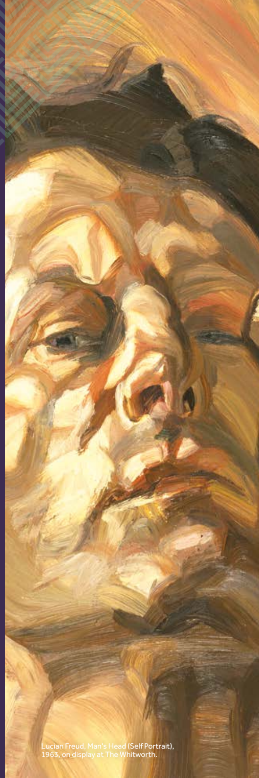
Lucian Freud, Man's Head (Self Portrait), 1963, on display at The Whitworth.

Our new pathway, taught in conjunction with Museology staff, focuses on curating and gallery studies, covering topics such as collecting, exhibiting, and art writing.