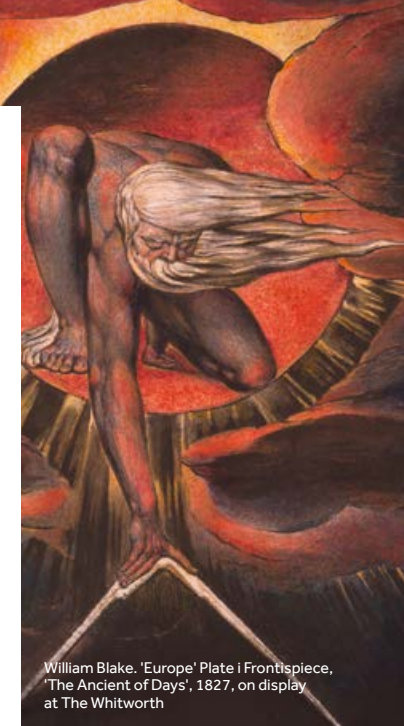
William Blake. 'Europe' Plate I Frontispiece, 'The Ancient of Days', 1827, on display at The Whitworth

IB: 34-31 including 5s in three Higher Level subjects