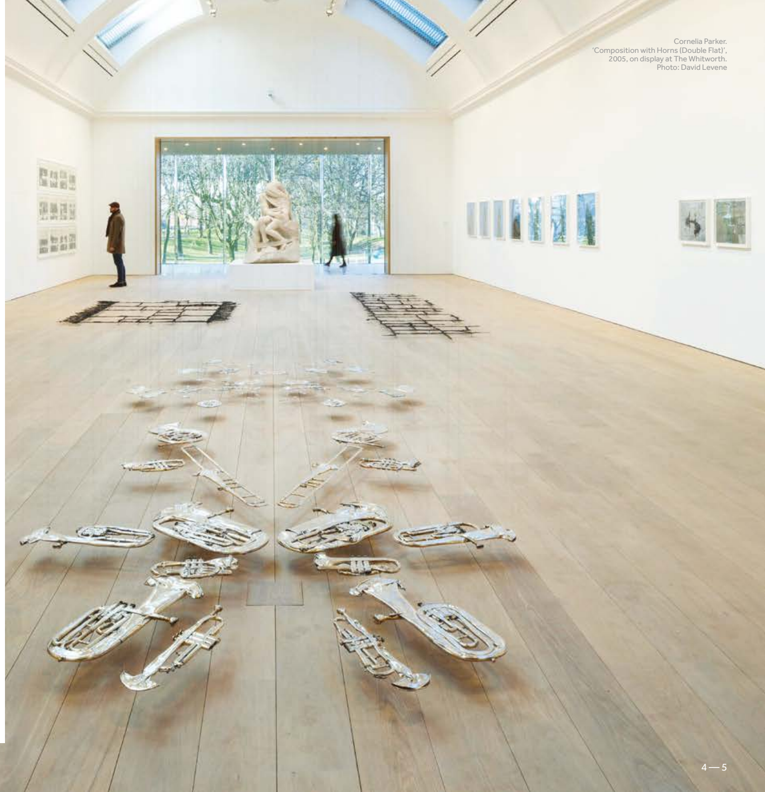
Cornelia Parker. "Composition with Horns (Double Flat)", 2005, on display at The Whitworth.

Manchester is a major arts destination - home to notable galleries such as The Lowry, The Chinese Centre for Contemporary Art, and Manchester Art Gallery as well as exclusive works, including those showcased by Manchester International Festival.