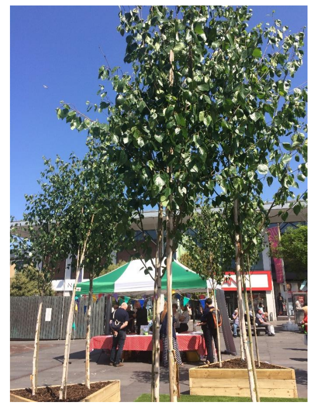
Image: Pop-up forest in the city centre of Liverpool, part of the Urban GreenUP project.