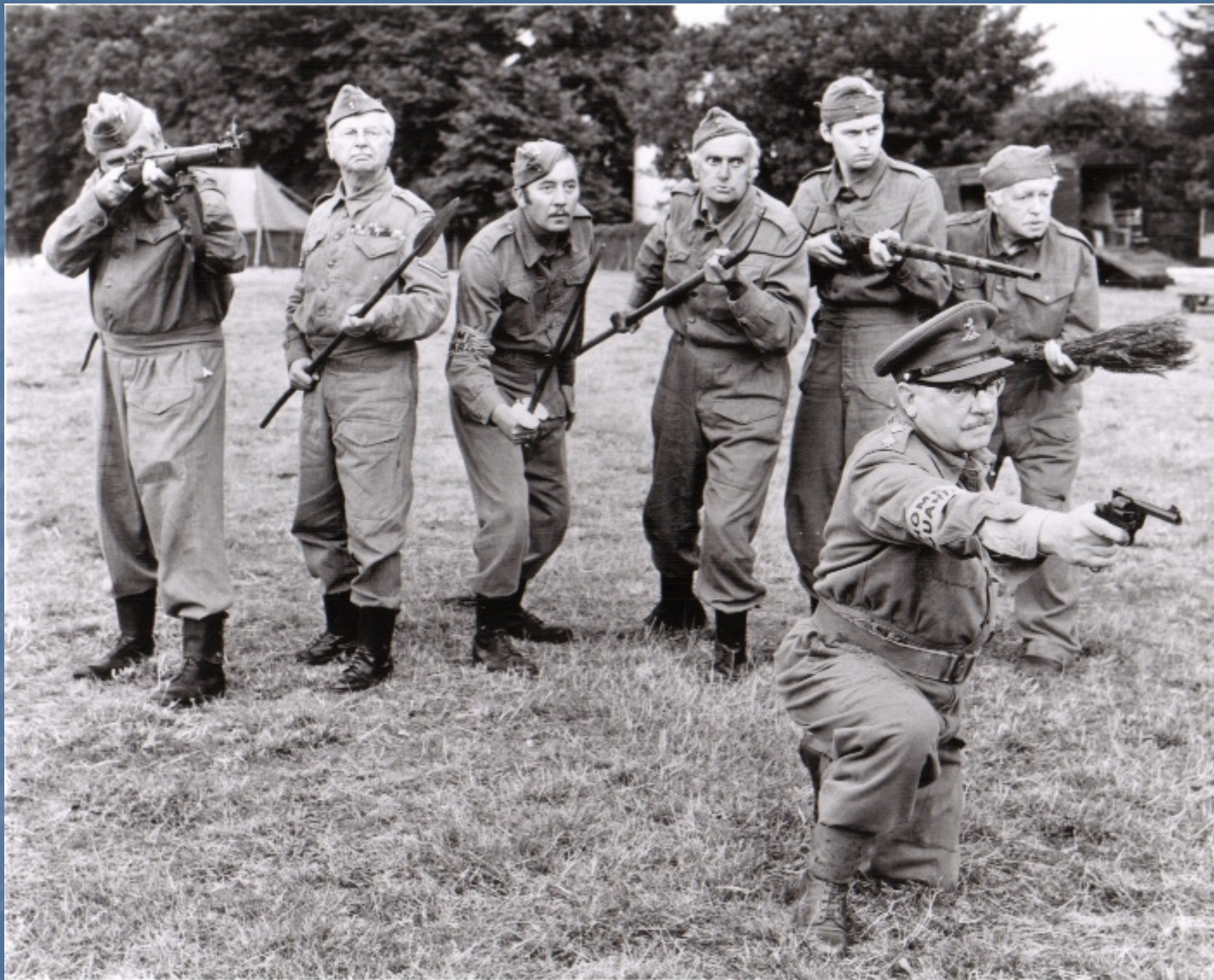
Cast of 'Dad's Army' BBC TV 1968-77