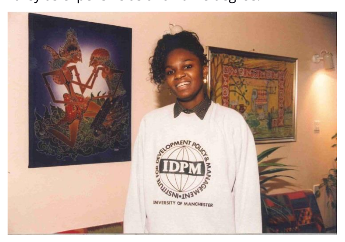
Students had a strong sense of identity with IDPM.