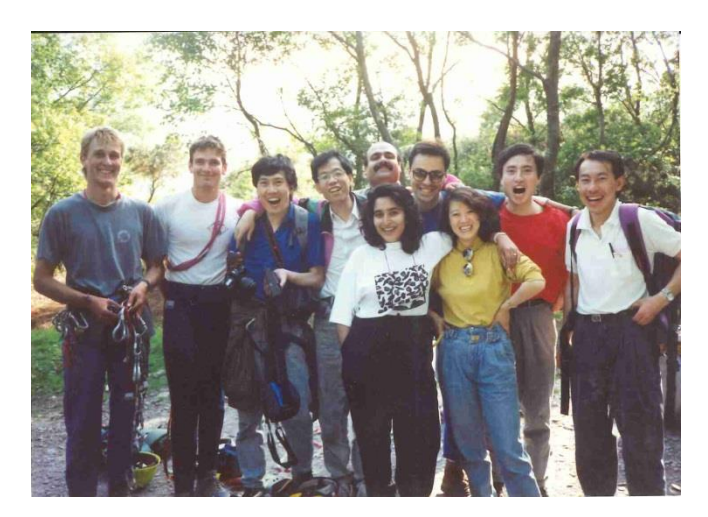
Students and staff form unique bonds through their studies and research particularly with fieldwork.

in First and Third Worlds" (Horner and Hulme, 2017, p 22).