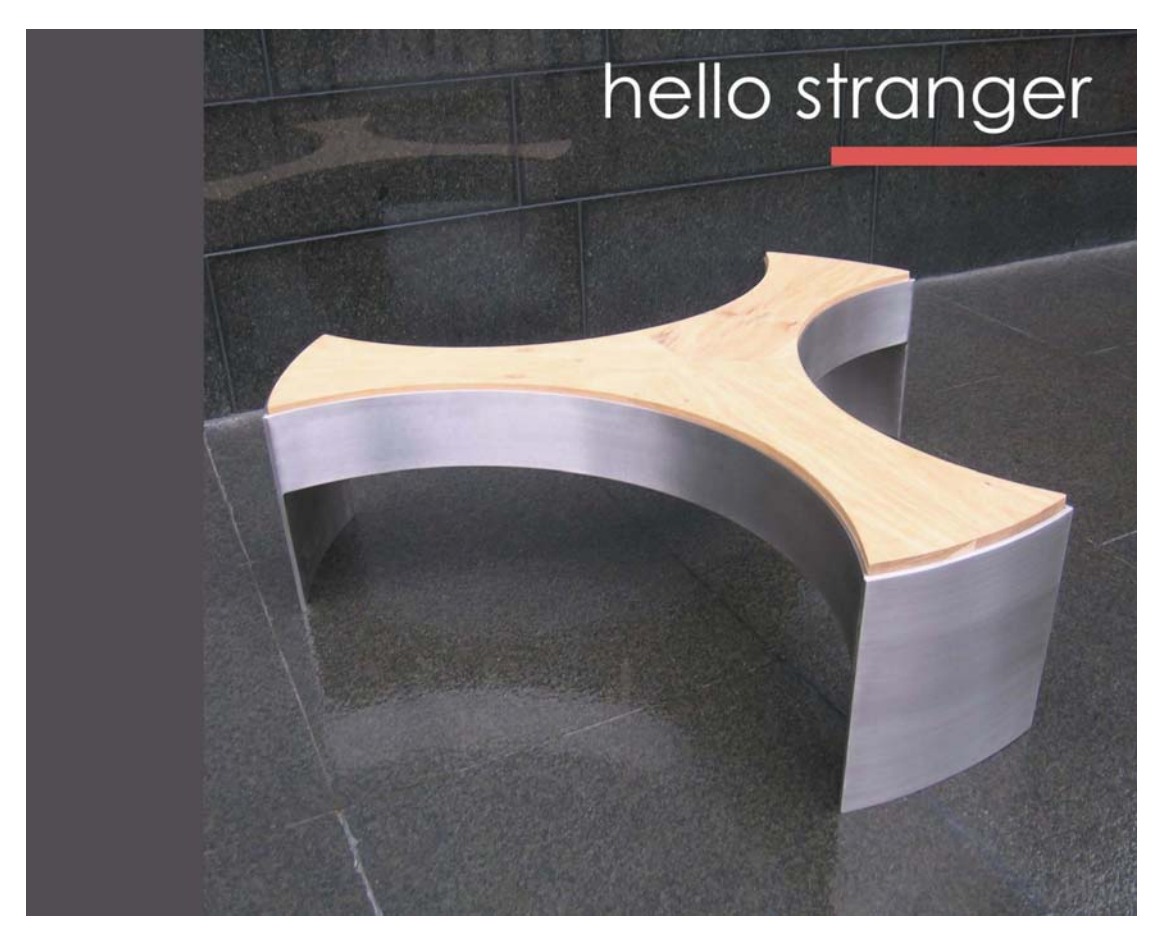
Figure 1: The City Squared Hello Stranger Bench

By creating clusters of the benches, the school has also in effect achieved a traffic calming measure within the expanse of the bustling atrium.